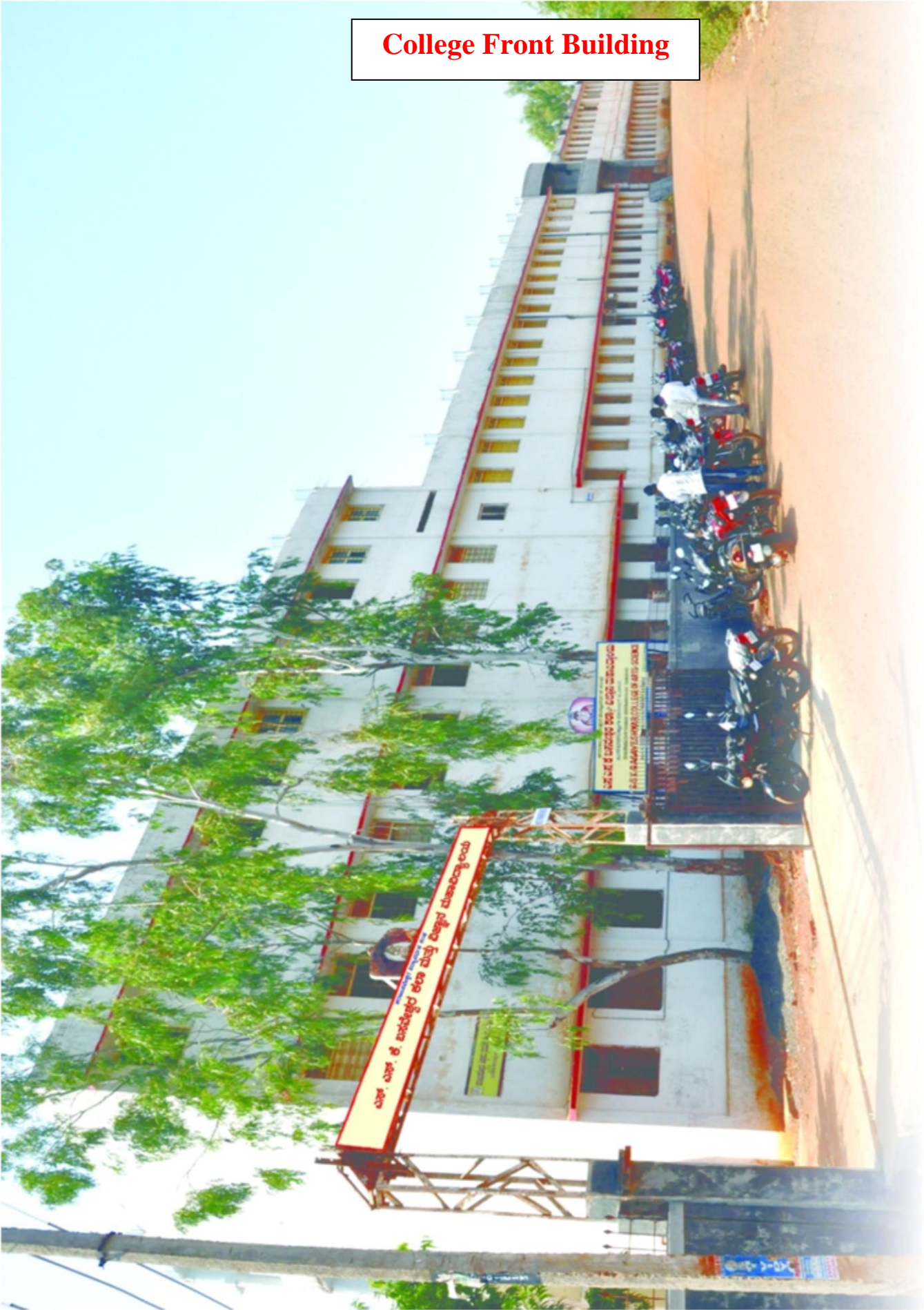
College Front Building