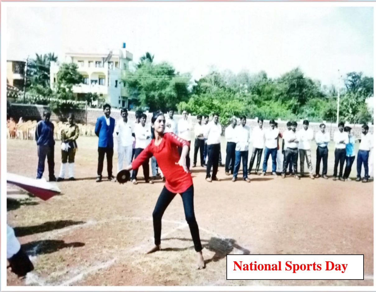
National Sports Day