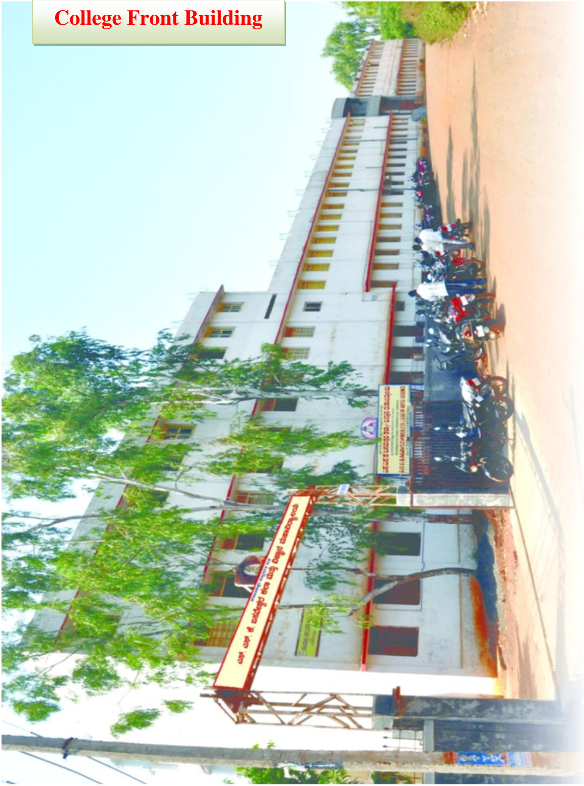
College Front Building