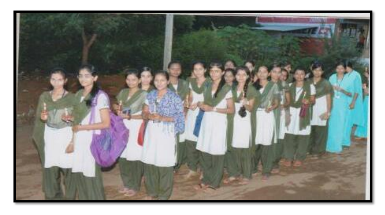
NSS Volunteers attending Yaad karo korbani programme