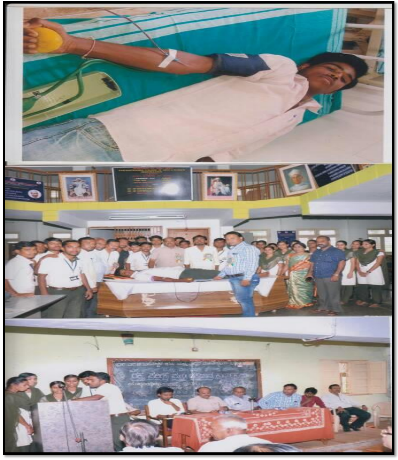
Blood Donation by NSS Volunteers