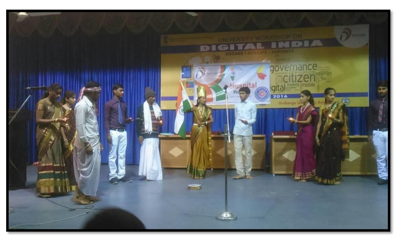
A Skit was played by our NSS Volunteers - Digital India programme