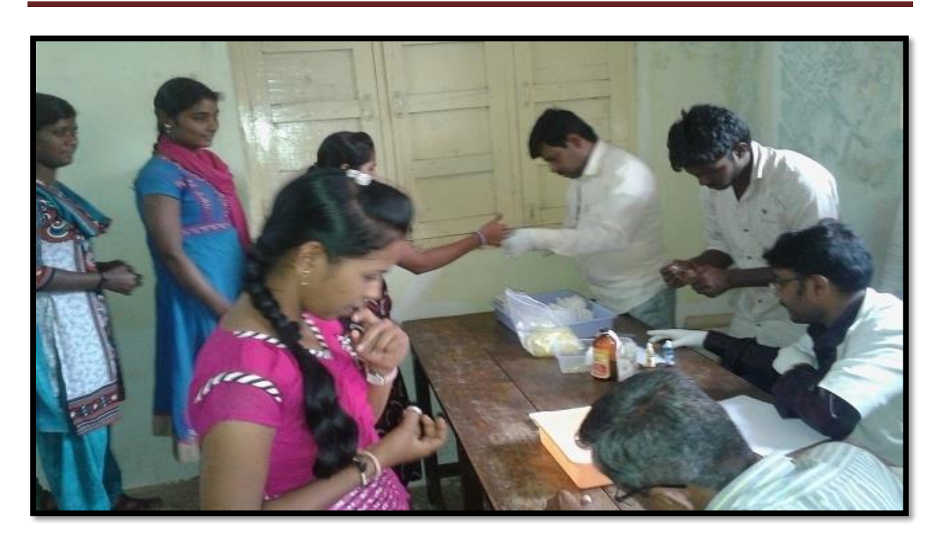
A team of medical staff of Medicare blood bank Kalburgi collecting the blood to detect the blood group