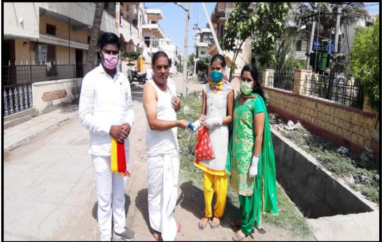
Our NSS volunteers distributing the masks & hand sanitizer