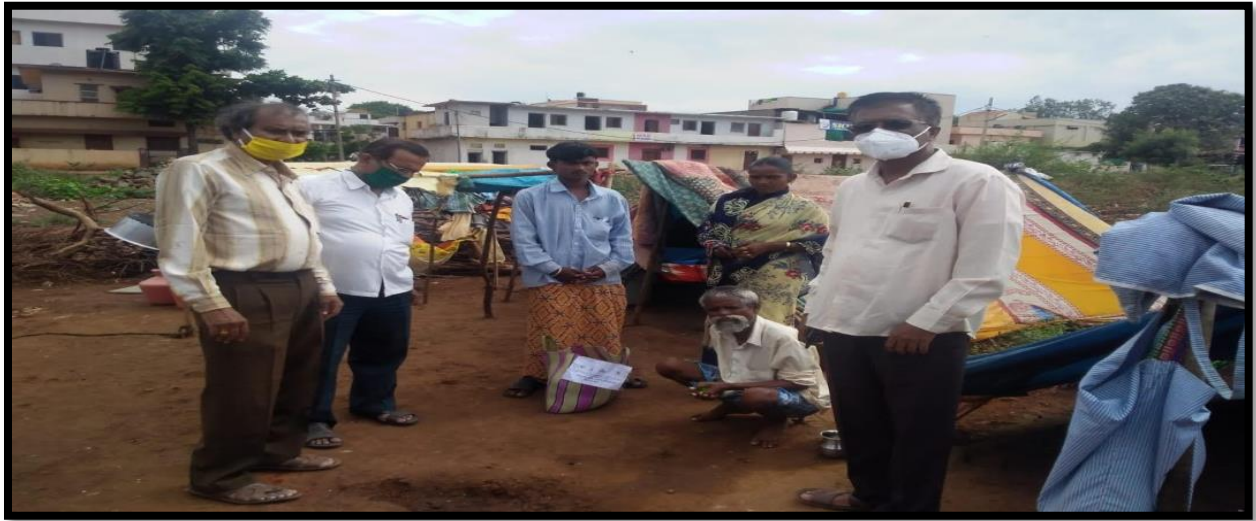
Principal &staff distributing food kits

Self-Stitched Masks by Students and Their Distribution