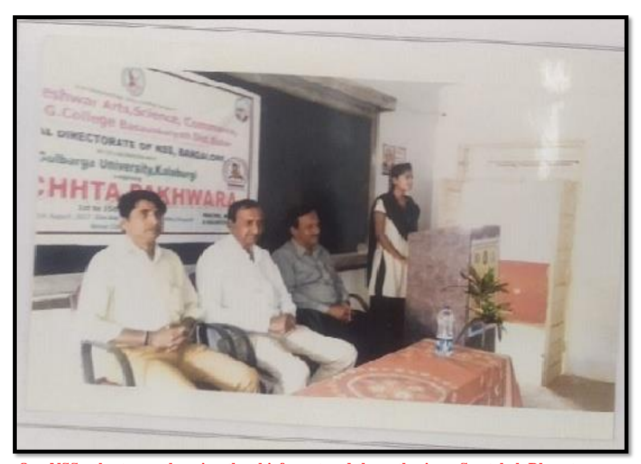
Our NSS volunteer welcoming the chief guest and the gathering - Swatchch Bharat Pakawara