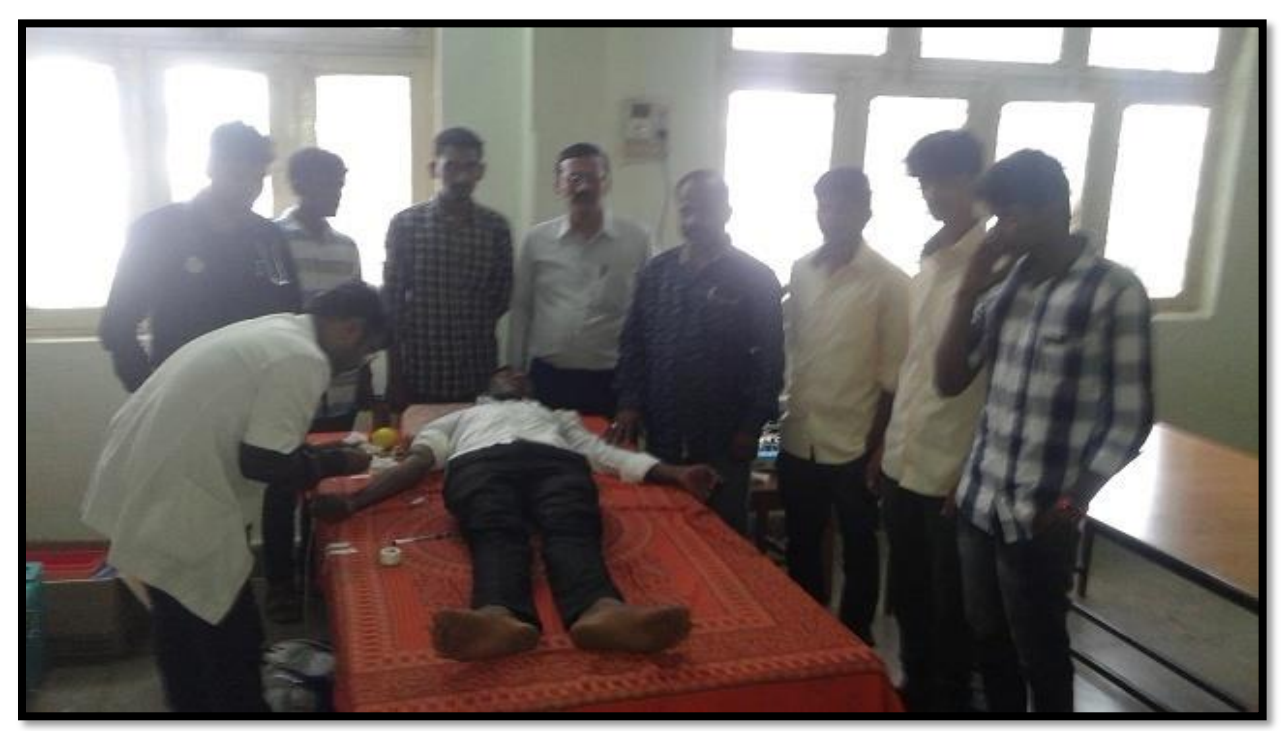
A team of medical staff of Medicare blood bank Kalburgi collecting the blood from the students