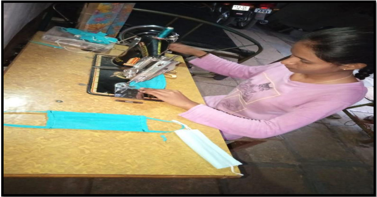
Our NSS volunteers stitching the masks