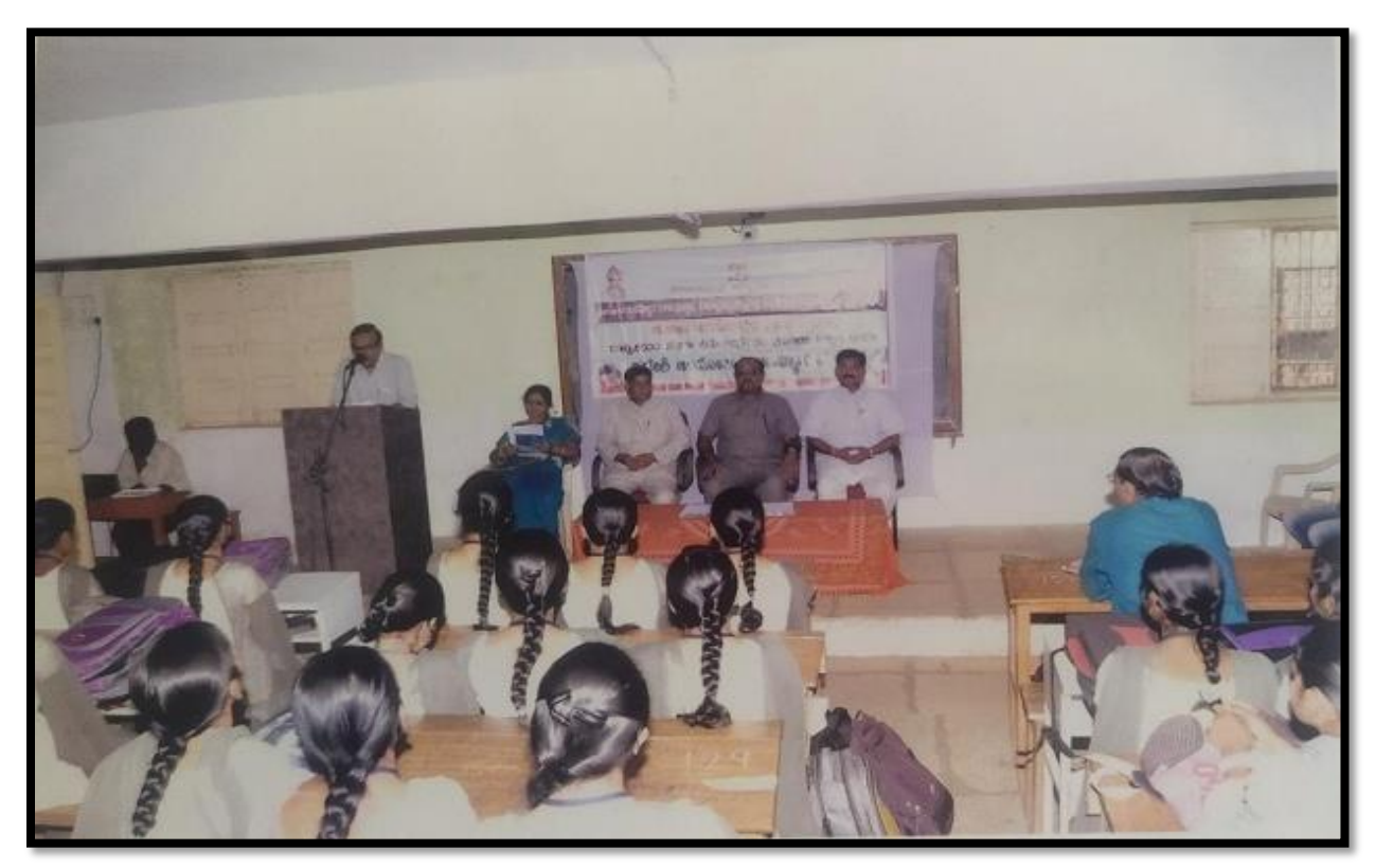
Swadeshi Movement Inaugural Function