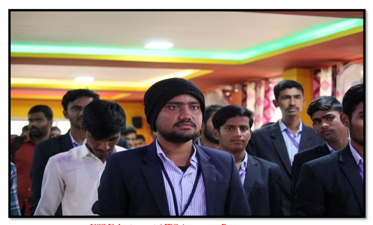
NSS Volunteers at AIDS Awareness Programs