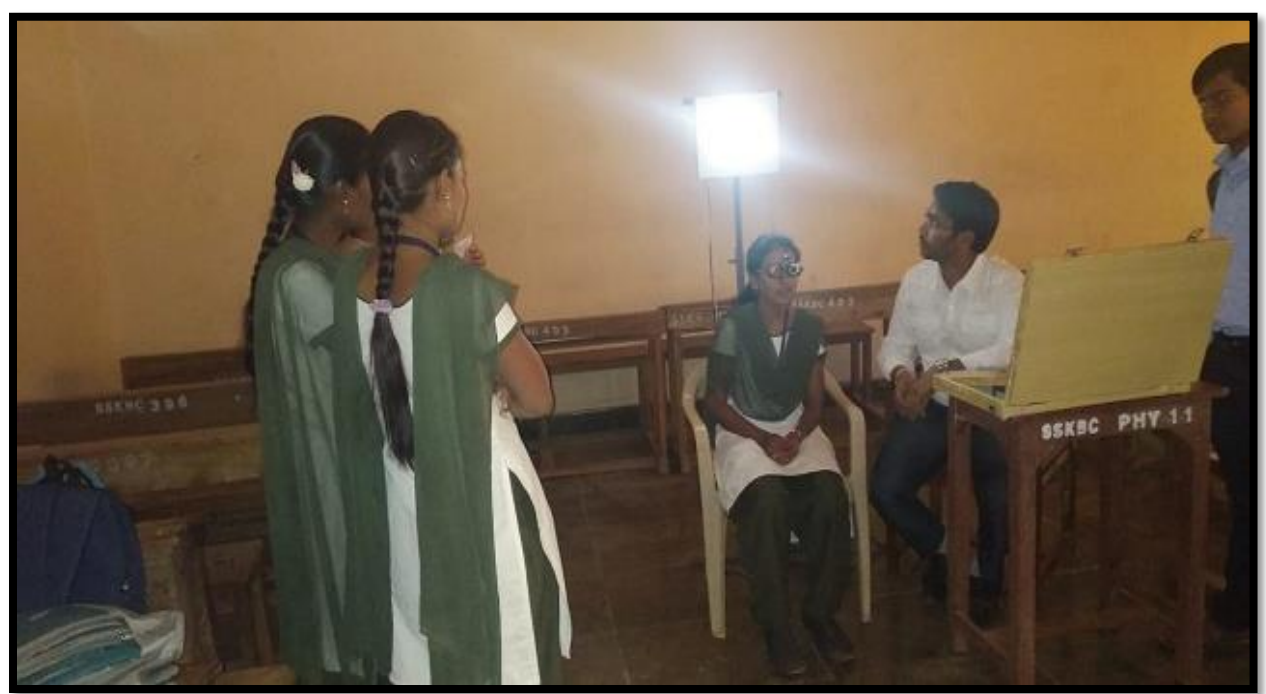
Students undergoing Eye Testing