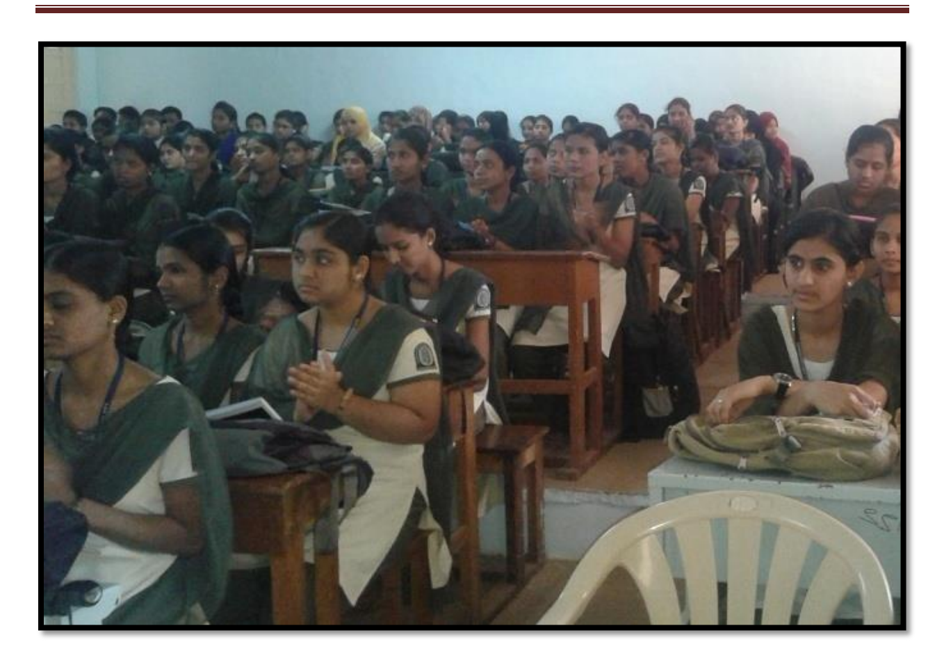
Students Attending the AIDS Awareness Program